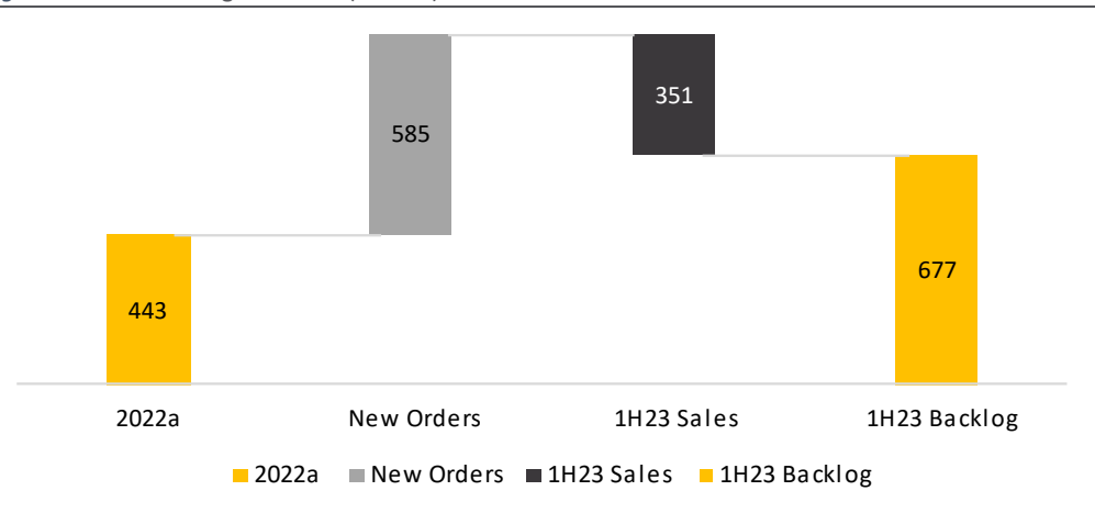
Figure 2: Order backlog evolution (SARmn) - 1H23